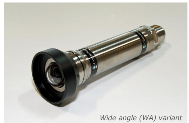
Wide angle (WA) variant