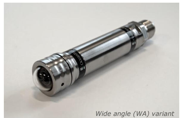
Wide angle (WA) variant